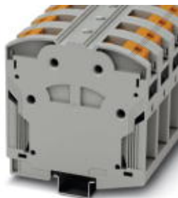
High-current terminal block, Connection method: Power-Turn connection, Number of positions: 1, Cross section: 50 mm 2 - 150 mm 2 , AWG: 1/0 - 300 kcmil, Width: 31 mm, Color: gray, Mounting type: NS 35/15

Please be informed that the data shown in this PDF Document is generated from our Online Catalog. Please find the complete data in the user's documentation. Our General Terms of Use for Downloads are valid ( http://phoenixcontact.com/download )