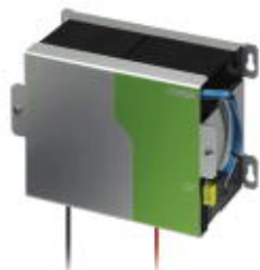
Power storage device, lead AGM, VRLA technology, 24 V DC, 12 Ah. Connection via pin cable lug, 14 mm.

Please be informed that the data shown in this PDF Document is generated from our Online Catalog. Please find the complete data in the user's documentation. Our General Terms of Use for Downloads are valid ( http://phoenixcontact.com/download )