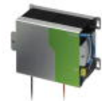
Power storage device, lead AGM, VRLA technology, 24 V DC, 12 Ah. Connection via pin cable lug, 14 mm.

Power storage devices - QUINT-BAT/24DC/12AH - 2866365