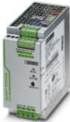
Primary-switched QUINT POWER power supply for DIN rail mounting with SFB (Selective Fuse Breaking) Technology, input: 3-phase, output: 24 V DC/10 A

Please be informed that the data shown in this PDF Document is generated from our Online Catalog. Please find the complete data in the user's documentation. Our General Terms of Use for Downloads are valid ( http://phoenixcontact.com/download )