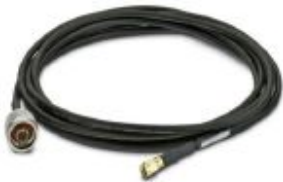
The figure shows a version of the product

Antenna cable, outside diameter: 5 mm (0.2 in.), inner conductor: solid, attenuation: 0.4 / 0.5 / 0.6 dB at 0.9 / 2.4 / 5.8 GHz, connection: N (male) -> RSMA (male), cable length: 0.5 m (1.6 ft.)