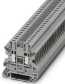
Reducing bridge, Pitch: 12.8 mm, Number of positions: 2, Color: red

Please be informed that the data shown in this PDF Document is generated from our Online Catalog. Please find the complete data in the user's documentation. Our General Terms of Use for Downloads are valid ( http://phoenixcontact.com/download )