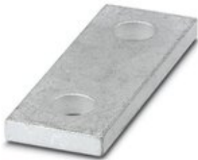
Connection rail, number of positions: 2, color: silver

Please be informed that the data shown in this PDF Document is generated from our Online Catalog. Please find the complete data in the user's documentation. Our General Terms of Use for Downloads are valid ( http://phoenixcontact.com/download )