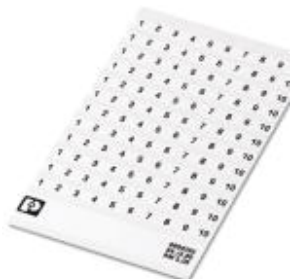
Marker card, self-adhesive, horizontally labeled with the consecutive numbers: 1 ... 10, 10-section marker strips with 12 identical decades, white

Please be informed that the data shown in this PDF Document is generated from our Online Catalog. Please find the complete data in the user's documentation. Our General Terms of Use for Downloads are valid ( http://phoenixcontact.com/download )