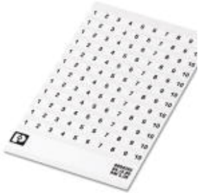
Marker card, self-adhesive, horizontally labeled with the consecutive numbers: 11 ... 20, 10-section marker strips with 12 identical decades, white

Please be informed that the data shown in this PDF Document is generated from our Online Catalog. Please find the complete data in the user's documentation. Our General Terms of Use for Downloads are valid ( http://phoenixcontact.com/download )