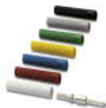
Insulating sleeve, Color: yellow