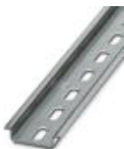
DIN rail, material: Galvanized, perforated, height 7.5 mm, width 35 mm, length: 2 m

DIN rail - NS 35/ 7,5 ZN PERF 2000MM - 1206421