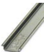
DIN rail, material: Steel, unperforated, height 7.5 mm, width 35 mm, length: 2 m

DIN rail - NS 35/ 7,5 UNPERF 2000MM - 0801681