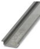
DIN rail, unperforated, Width: 35 mm, Height: 7.5 mm, Length: 2000 mm, Color: silver

DIN rail, unperforated - NS 35/ 7,5 AL UNPERF 2000MM - 0801704