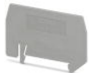
Partition plate, Length: 61 mm, Width: 2 mm, Height: 42 mm, Color: gray

DIN rail perforated - NS 35/ 7,5 PERF 2000MM - 0801733