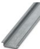
DIN rail, material: Galvanized, unperforated, height 7.5 mm, width 35 mm, length: 2 m

DIN rail - NS 35/ 7,5 ZN UNPERF 2000MM - 1206434