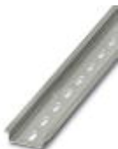
DIN rail, material: steel galvanized and passivated with a thick layer, perforated, height 7.5 mm, width 35 mm, length: 2000 mm

DIN rail perforated - NS 35/ 7,5 PERF 2000MM - 0801733