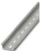
DIN rail, material: steel galvanized and passivated with a thick layer, perforated, height 7.5 mm, width 35 mm, length: 2000 mm

DIN rail perforated - NS 35/ 7,5 PERF 2000MM - 0801733