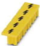
Warning cover, Strip, yellow, labeled, Mounting type: Plug in, Lettering field: 4.5 x 5.55 mm