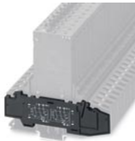
End cover, Length: 115 mm, Width: 6 mm, Color: black

Please be informed that the data shown in this PDF Document is generated from our Online Catalog. Please find the complete data in the user's documentation. Our General Terms of Use for Downloads are valid ( http://download.phoenixcontact.com )