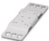
Universal wall adapter

Assembly adapters - UWA 182/52 - 2938235