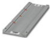
Magazine, for CMS-P1-PLOTTER, for accommodating UC-WMC 7,5...