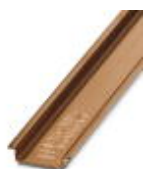
DIN rail, material: Copper, unperforated, height 7.5 mm, width 35 mm, length: 2 m

DIN rail, unperforated - NS 35/ 7,5 CU UNPERF 2000MM - 0801762