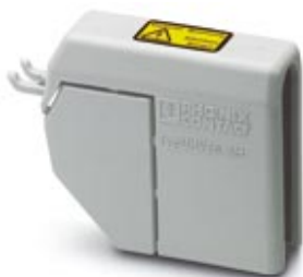
Covering hood, Width: 36.8 mm, Height: 65.5 mm, Color: gray

Please be informed that the data shown in this PDF Document is generated from our Online Catalog. Please find the complete data in the user's documentation. Our General Terms of Use for Downloads are valid ( http://download.phoenixcontact.com )