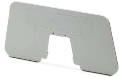
Illustration shows the product version UHV-TP 1

http://eshop.phoenixcontact.de/phoenix/treeViewClick.do?UID=2130415