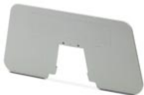
Separating plate, Width: 2 mm, Height: 67.5 mm, Color: gray

Please be informed that the data shown in this PDF Document is generated from our Online Catalog. Please find the complete data in the user's documentation. Our General Terms of Use for Downloads are valid ( http://download.phoenixcontact.com )