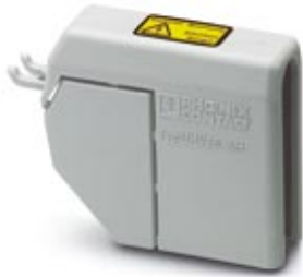
Covering hood, Width: 49.8 mm, Height: 77 mm, Color: gray

Please be informed that the data shown in this PDF Document is generated from our Online Catalog. Please find the complete data in the user's documentation. Our General Terms of Use for Downloads are valid ( http://download.phoenixcontact.com )