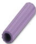
Insulating sleeve, Color: violet