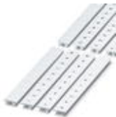
Zack marker strip, Strip, white, labeled, can be labeled with: Plotter, Printed horizontally: Identical numbers 1 or 2, etc. up to 100, Mounting type: Snap into tall marker groove, for terminal block width: 10.2 mm, Lettering field: 10.15 x 10.5 mm

Zack marker strip - ZB10,LGS:GLEICHE ZAHLEN - 1053030