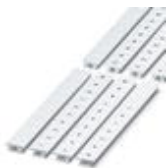
Zack marker strip, Strip, white, labeled, can be labeled with: Plotter, Printed horizontally: Consecutive numbers 1 - 10, 11 - 20, etc. up to 991 - 1000, Mounting type: Snap into tall marker groove, for terminal block width: 10.2 mm, Lettering field: 10.15 x 10.5 mm

Zack marker strip - ZB10,LGS:FORTL.ZAHLEN - 1053014