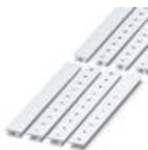
Zack marker strip, Strip, white, labeled, can be labeled with: Plotter, Printed vertically: Consecutive numbers 1 - 10, 11 - 20, etc. up to 991 - 1000, Mounting type: Snap into tall marker groove, for terminal block width: 10.2 mm, Lettering field: 10.15 x 10.5 mm

Zack marker strip - ZB10,QR:FORTL.ZAHLEN - 1053027