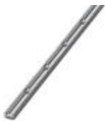
Cross connection rail, for fixed bridging of identical inputs and outputs, made of Cu, nickel-plated, 1 m long