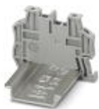
Quick mounting end clamp for NS 35/7,5 DIN rail or NS 35/15 DIN rail, with marking option, with parking option for FBS...5, FBS...6, KSS 5, KSS 6, width: 5.15 mm, color: gray