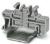
Quick mounting end clamp for NS 35/7,5 DIN rail or NS 35/15 DIN rail, with marking option, width: 9.5 mm, color: gray