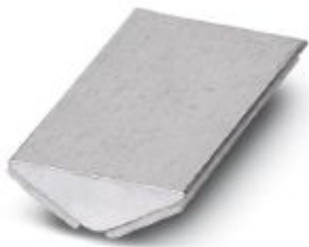
Insertion profile, color: silver

Please be informed that the data shown in this PDF Document is generated from our Online Catalog. Please find the complete data in the user's documentation. Our General Terms of Use for Downloads are valid ( http://phoenixcontact.com/download )