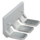
Insertion bridge, Number of positions: 3, Color: gray

Insertion bridge - EB 3-36/UKH - 0201414