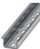
DIN rail, material: Galvanized, perforated, height 15 mm, width 35 mm, length: 2 m

DIN rail - NS 35/15 ZN PERF 2000MM - 1206599