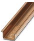
DIN rail, material: Copper, unperforated, 1.5 mm thick, height 15 mm, width 35 mm, length: 2 m

DIN rail - NS 35/15 CU UNPERF 2000MM - 1201895