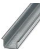
DIN rail, material: Galvanized, unperforated, height 15 mm, width 35 mm, length: 2 m

DIN rail - NS 35/15 ZN UNPERF 2000MM - 1206586