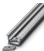
DIN rail, deep drawn, high profile, unperforated, 1.5 mm thick, material: aluminum, height 15 mm, width 35 mm, length 2000 mm

DIN rail, unperforated - NS 35/15 AL UNPERF 2000MM - 1201756