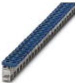
Connection terminal block, Connection method Screw connection, Load current : 125 A, Cross section: 2.5 mm 2 - 35 mm 2 , Width: 14.3 mm, Color: blue

Connection terminal block - AKG 35 BU - 0424013