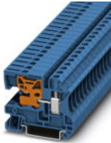
N disconnect terminal block, Screw connection, Cross section: 0.2 mm 2 - 10 mm 2 , AWG: 24 - 8, Width: 8.2 mm, Color: blue, Mounting type: NS 35/7,5, NS 35/15

Please be informed that the data shown in this PDF Document is generated from our Online Catalog. Please find the complete data in the user's documentation. Our General Terms of Use for Downloads are valid ( http://download.phoenixcontact.com )