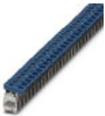
Connection terminal block, Connection method Screw connection, Load current : 76 A, Cross section: 1.5 mm 2 - 16 mm 2 , Width: 9.8 mm, Color: blue

Connection terminal block - AKG 16 BU - 0423014