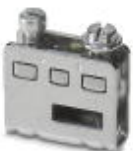
Branch terminal, Connection method Screw connection, Cross section: 0.5 mm 2 - 16 mm 2 , Width: 7.7 mm, Color: gray