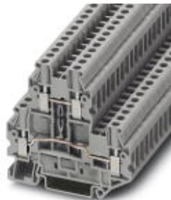
Double-level terminal block with a screw connection, cross section: 0.14 mm 2 - 6 mm 2 , AWG: 26 - 10, width: 6.2 mm, color: Gray

Please be informed that the data shown in this PDF Document is generated from our Online Catalog. Please find the complete data in the user's documentation. Our General Terms of Use for Downloads are valid ( http://download.phoenixcontact.com )