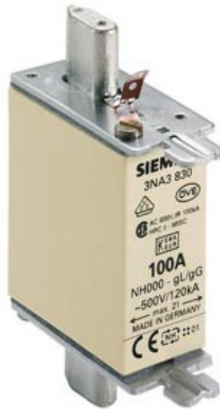
LV HRC FUSE LINK GL/GG WITH NON-INSULATED GRIP LUGS WITH FRONT INDICATOR SIZE 000, 100A, AC 500V/DC 250V