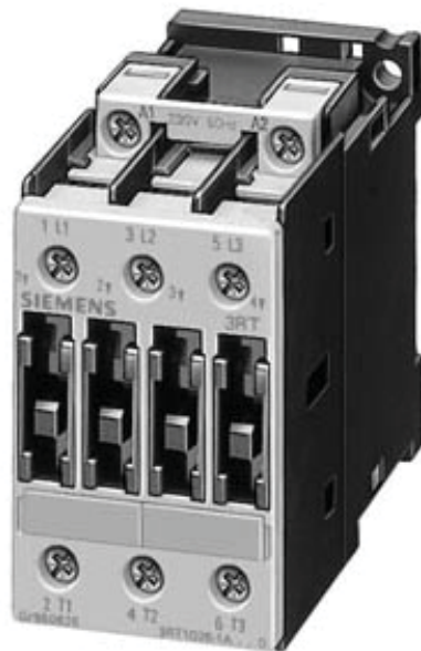
CONTACTOR, AC-3 7,5 KW/400 V, AC 230 V, 50/60 HZ, 3-POLE, SIZE S0, SCREW CONNECTION