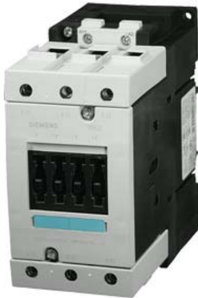
CONTACTOR, AC-3 37 KW/400 V, DC 24 V, 3-POLE, SIZE S3, SCREW CONNECTION