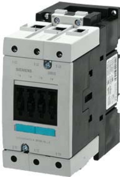
CONTACTOR, AC-3 45 KW/400 V, AC 230V 50/60HZ 3-POLE, SIZE S3, SCREW CONNECTION