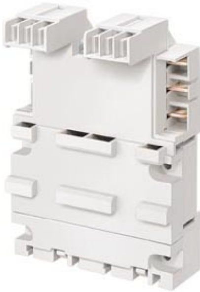
3-PHASE BUSBAR INCL. EXTENSION PLUG FOR 2 MSPS, SIZE S00 AND S0