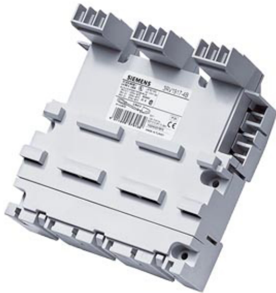
3-PHASE BUSBAR INCL. EXTENSION PLUG FOR 3 MSPS, SIZE S00 AND S0