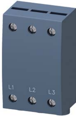
3-phase supply terminal for 3-phase busbar Size S0 and S00 connection from below