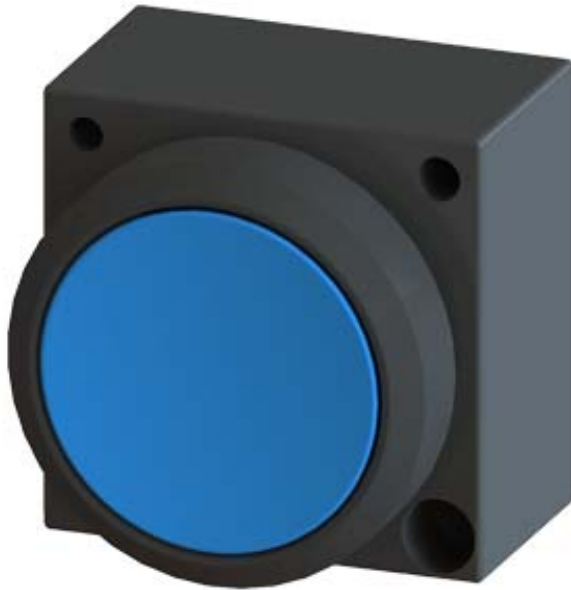
22MM PLASTIC ROUND ACTUATOR: PUSHBUTTON WITH FLAT BUTTON WITH HOLDER BLUE