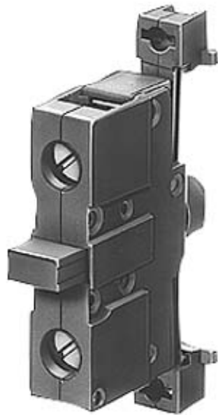
COMPONENT FOR ENCLOSURE, 22MM CONTACT BLOCK WITH 1 CONTACT ELEMENT SCREW TERMINAL, 1NC