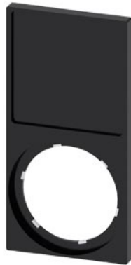
Label holder, 22mm, frame rectangular at the bottom, black, for labeling plate 27mm x 27mm, for gluing