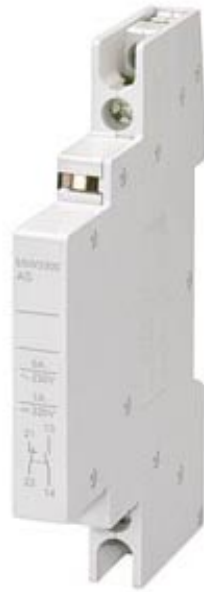
AUXILIARY SWITCH ATTACHABLE F. RES.CURRENT OP.CIRC. BREAKER F. 16 TO 80A, 1NO+1NC