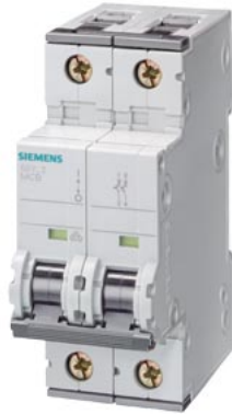
Miniature circuit breaker 400 V 10kA, 2-pole, B, 6 A, D=70 mm