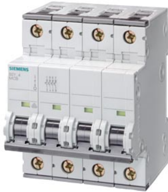
Miniature circuit breaker 400 V 10kA, 4-pole, D, 32 A, D=70 mm