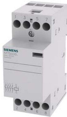
INSTA contactor with 4 NO contacts Contact for 230 V AC, 400V 25A Control AC/24 V DC