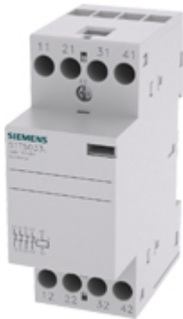
INSTA contactor with 4 NC contacts Contact for 230 V AC, 400V 25A Control AC/24 V DC