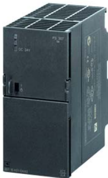
SIMATIC S7-300 STABILIZED POWER SUPPLY PS307 INPUT: 120/230 V AC OUTPUT: DC 24 V DC/5 A