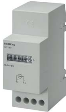
time counter, mechanical, 10-27V DC