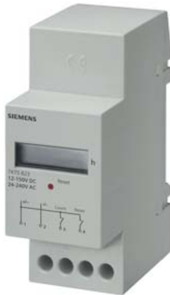
ELECTRONIC PULSE COUNTER DC 12-150V, 24-240V, 50HZ ELECTRICAL A. MECHANICAL RESET