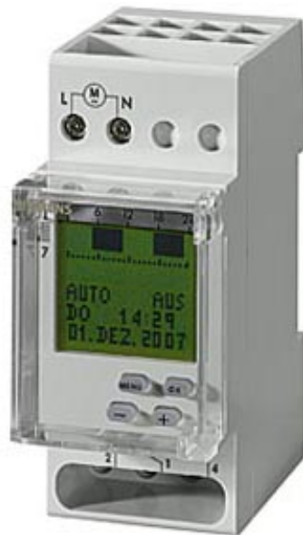
DIGITAL TIME SWITCH TOP 1 CHANNEL WEEK 230V 2 TE