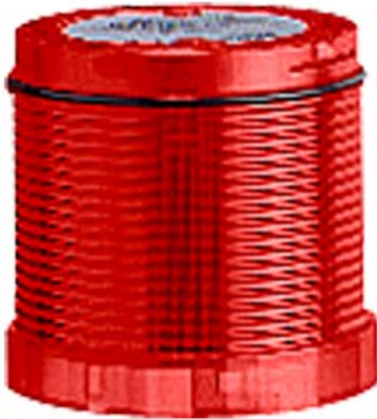
SIGNALLING COLUMN STEADY LIGHT LED RED, 24V AC/DC