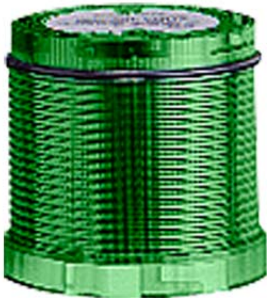
SIGNALLING COLUMN STEADY LIGHT LED GREEN, 24V AC/DC