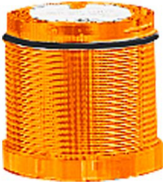
SIGNALLING COLUMN STEADY LIGHT LED YELLOW, 24V AC/DC