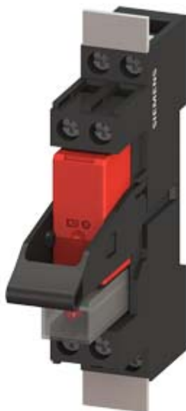
PLUG-IN RELAY COMPACT UNIT DC 24V, 2 CO CONTACT LED MODULE RED STANDARD PLUG-IN SOCKET SCREW TERMINAL